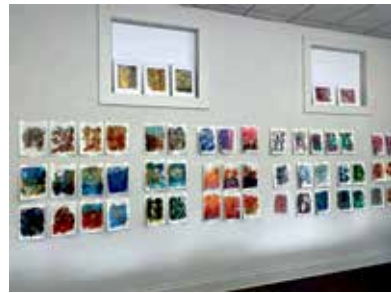
Completed Gelli Prints on the wall