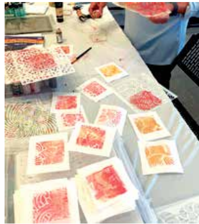
Gelli Prints class