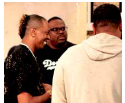
Audience members mingling with poet ANON The Griot.

To stay informed about upcoming Exchange events and other South Fulton Arts initiatives, be sure to visit SOUTHFULTONARTS.ORG