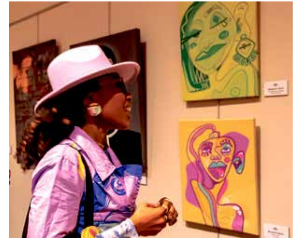
An art lover at the show

Union City and South Fulton Arts anticipate an extraordinary talent showcase at The Creative Exchange: K-12 Student Art Show, reinforcing the City’s commitment to fostering creativity and celebrating the arts in the community.