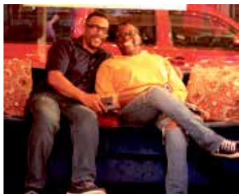
Audience members after a reading