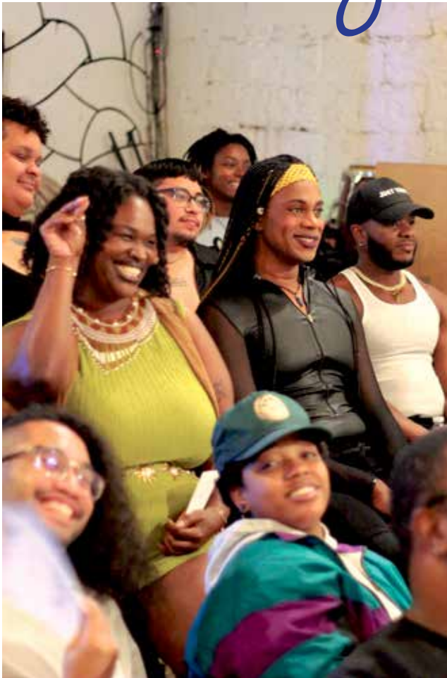
Audience members enjoying one of the performances from the night

Looking ahead, South Fulton Arts is thrilled to announce the next Exchange event, scheduled for April 11, titled Behind the Music . This edition promises to unravel the mysteries behind the creation of musical masterpieces, offering an insider's perspective into the world of musicians and songwriters. Attendees can anticipate an evening filled with melodic enchantment and insightful conversations that demystify the creative process. As Exchange continues to evolve for the community, it provides a space where artists and art enthusiasts can come together to share, learn, and grow. The program's commitment to breaking down barriers and fostering connections aligns seamlessly with South Fulton Arts' mission to create a vibrant, inclusive arts community.